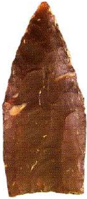
This resharpened point found in Kincaid Shelter has been identified as a Clovis point.