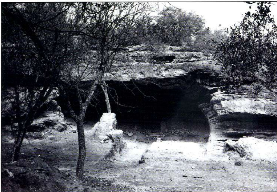
Exterior cave photo.

Activities include a sound and movement Time Travel trip to Kincaid Shelter led by TBH's own Dr. Dirt, the armadillo archeologist, as well as a downloadable lesson plan that incorporates learning about giant Ice Age creatures (megafauna) with the principles of stratigraphy (layering of the earth), and a related interactive Ice Age critters matching game.