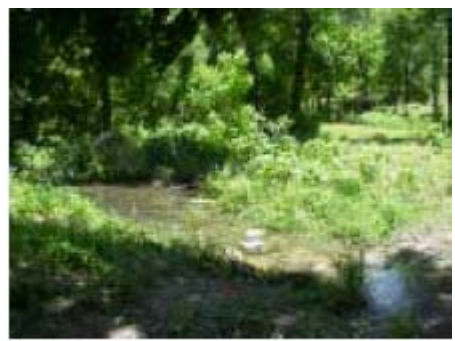
Native Vegetation at Gault

Even today, the Gault site has plenty of useful native vegetation. You can find trees like native pecan, oak, elm, Black walnut, Black hickory, and post oak (which are all common to the Blackland Prairie ecoregion). You can also see switchgrass, buffalograss, live oak, juniper, and curly mesquite (which are all common to the Edwards Plateau ecoregion). Early people used plants like the prickly pear, yucca, sotol, and the wild hyacinth to make food, fibers for clothing, sandals, and baskets, and materials for tools. All of these plants can still be found in that region today.