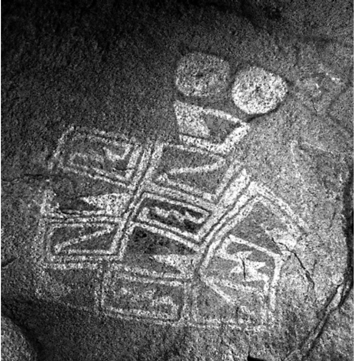
Hueco Tanks, Texas Date unknown, probably Late Formative Period