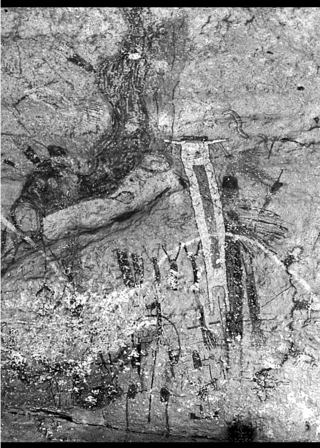
Lower Pecos, Texas Date unknown probably Late Archaic